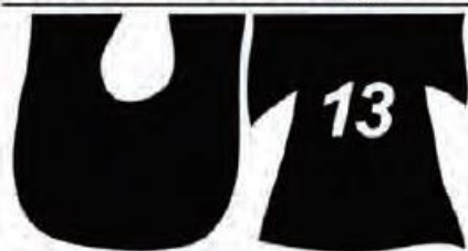
Underwater Technology 2013