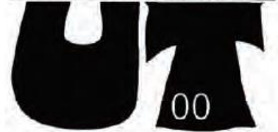
Underwater Technology 2000