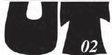
Underwater Technology 2002