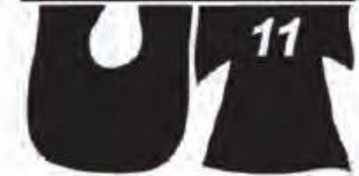
Underwater Technology 2011