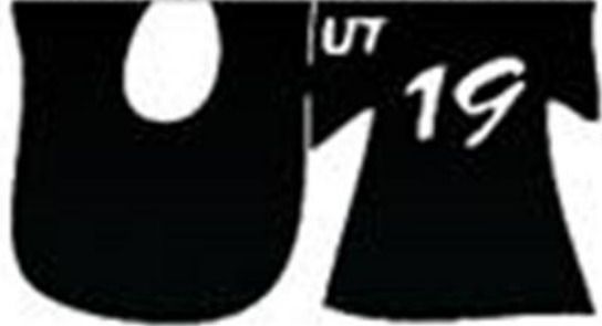
Underwater Technology 2019