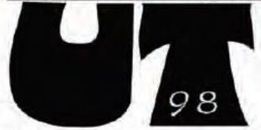
Underwater Technology '98

Is it "Blue Jeans and T-Shirts on a Wash-Line"?