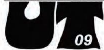
Underwater Technology 2009