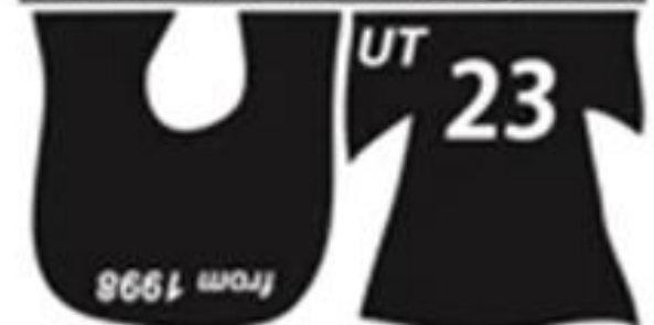
Underwater Technology 2023