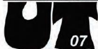
Underwater Technology 2007