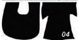
Underwater Technology 2004